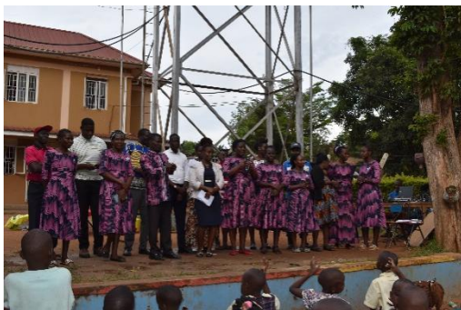
Team of staff members and volunteers