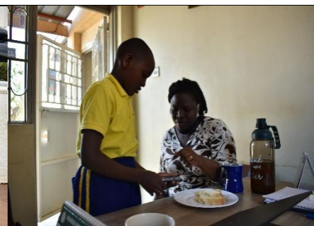
Learner spending quality time with director in S/L