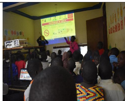
Setetizing children about Ebola