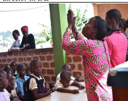
children learn praise and worship