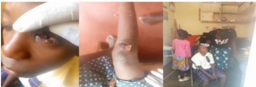
THE SCHOOL NURSE ATTENDING TO THE CHILDREN WITH INJURIES

I THEREFORE, CONVEY MY SINCERE THANKS TO THE SCHOOL ADMINISTRATION FOR THE SUPPORT GIVEN TO CHILDREN DURING GAMES AND SPORT. THIS INCLUDES FIRST AID ASSISTANCE FOR THOSE WHO GET INJURIES DURING GAMES, GLUCOSE FOR COOLING DOWN AFTER THE ACTIVITY. THANKYOU SO MUCH.