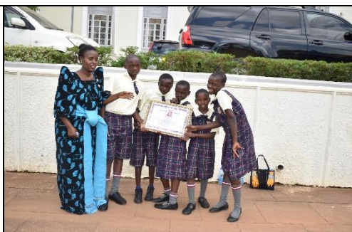
Children improving in sign language