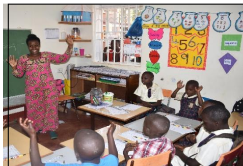
Children achieve a lesson in sign language

THE TABLE BELOW GIVES A SUMMARY OF THE ACTIVITIES CARRIED OUT